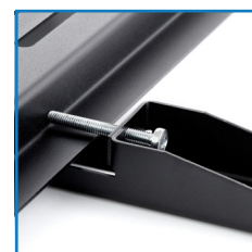
Screen protection against falling using screws