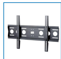
Minimalist design and functionality