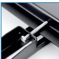
Screen protection against accidental falling or unauthorised removal using security screws